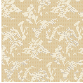
6018 Ocre 03 Print pattern