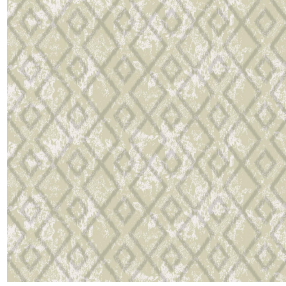
6021 Beige 63 Print pattern