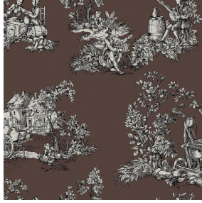
ZELIE Taupe 95 Print pattern