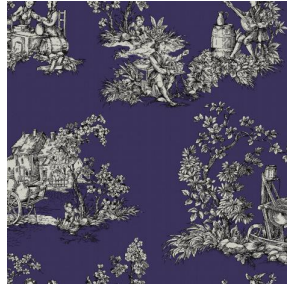
ZELIE Prune 84