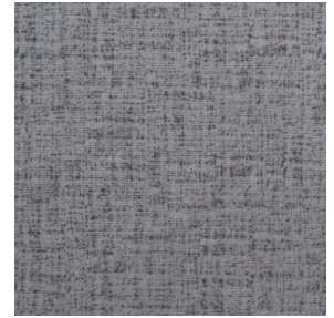
MURA MINERAL 157