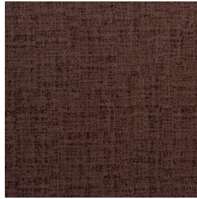
MURA TERRE 107