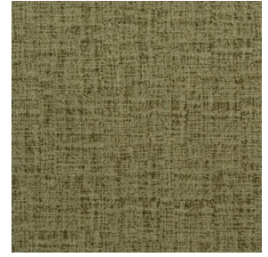
MURA OLIVE 61