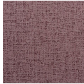
MURA ROSE 129