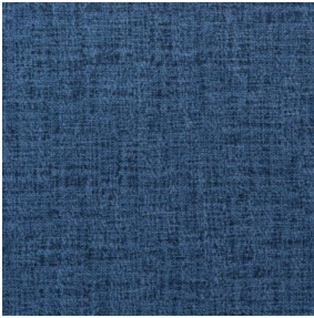
MURA SAPHIR 106