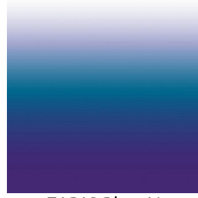
ZADIG Bleu 41