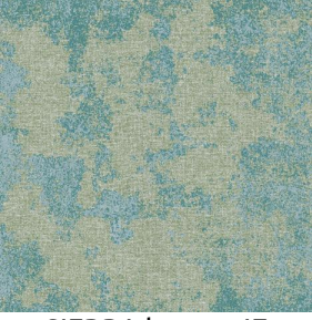
SIERRA brume 47