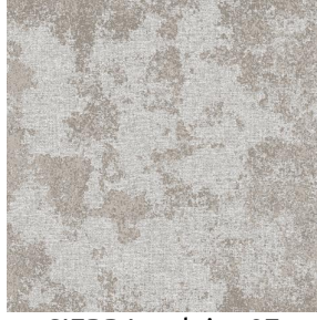
SIERRA ardoise 87