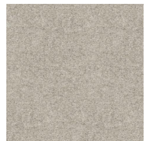
ELAINA Naturel 26