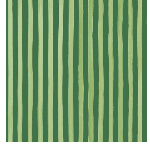
SONG Lierre 124