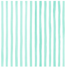
SONG Menthe 122