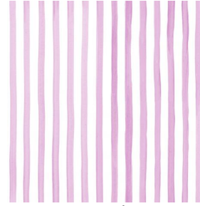
SONG Framboise 81