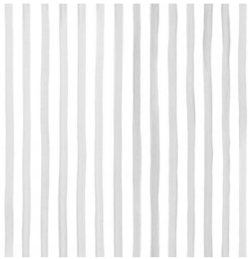
SONG Naturel 26