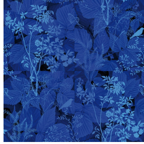
ODE Bleu 41 Print pattern