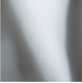
SATIN BPI 00 Printing support