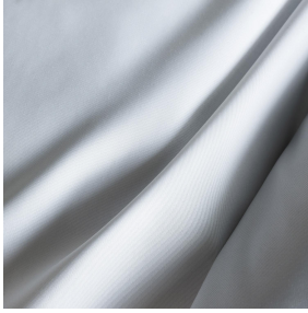
POL BPI 00 Printing support