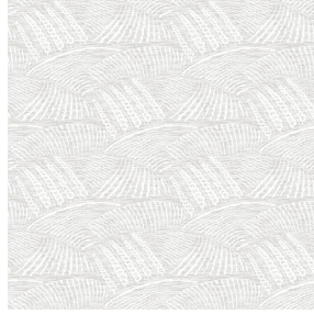
6046 Naturel 26 Print pattern