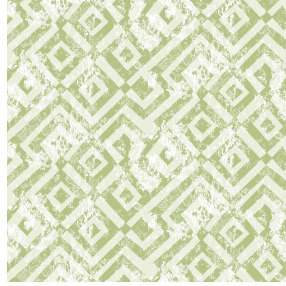
6040 Vert 24 Print pattern