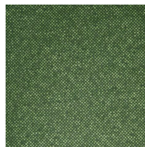
ANATOLE mousse 92