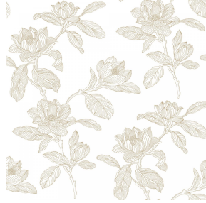
PAEONIA Beige 63 Print pattern