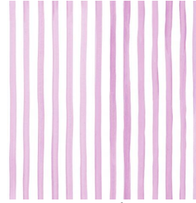
SONG Framboise 81