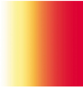
ZENITH Agrume 69