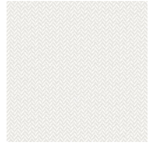
SCOURTIN Blanc 01