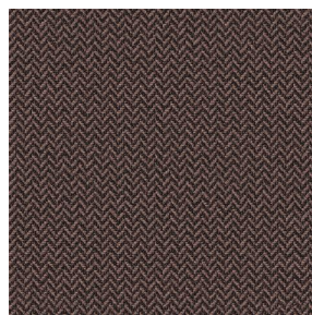
SCOURTIN Brun 23