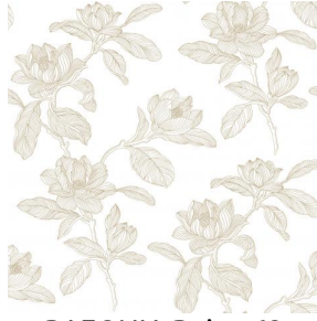
PAEONIA Beige 63