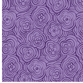
ONDES Violine 105 Print pattern