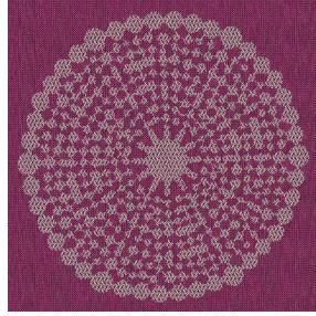
ANGELE Prune 84 Print pattern