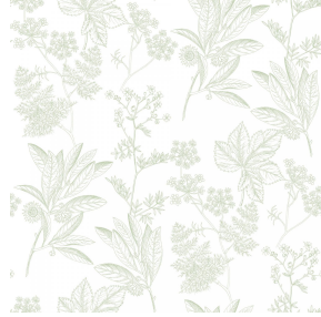
6051 Amande 75 Print pattern