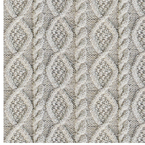
CALTRA Naturel 26 Print pattern