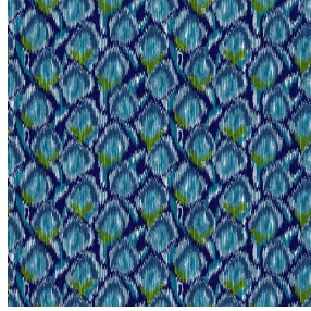
MANDU Bleu 41 Print pattern