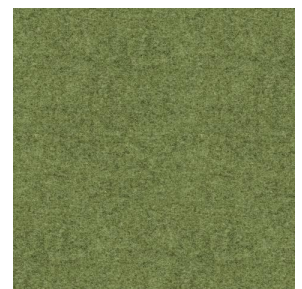
ELAINA Lierre 124