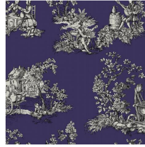
ZELIE Prune 84