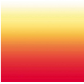
ZADIG Agrume 69