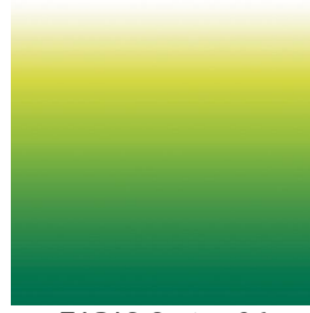
ZADIG Cactus 36