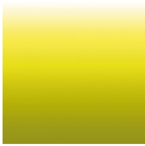
ZADIG Anis 62 Print pattern