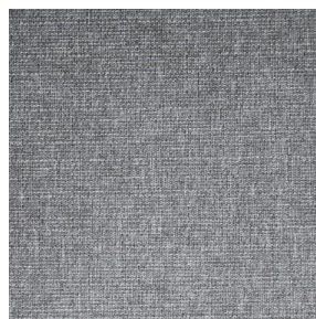
MUNA Sisal 140