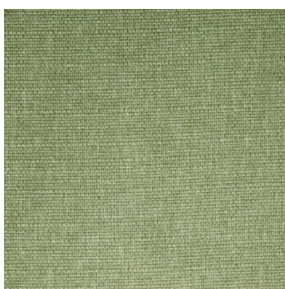
MUNA Tilleul 103