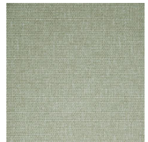
MUNA Sable 67