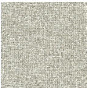
MUNA terre 107