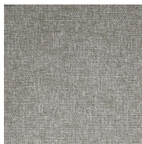
MUNA Chanvre 72