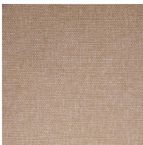
MUNA Saumon 143