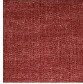
MUNA Rouge 21