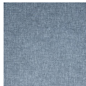
MUNA Tourterelle 138