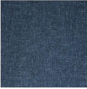
MUNA Indigo 144