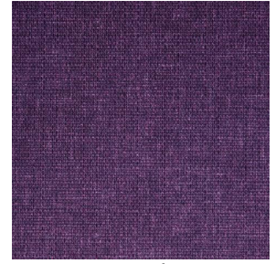
MUNA Saphir 106