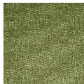
MUNA Olive 61