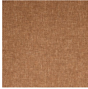
MUNA Sienne 29