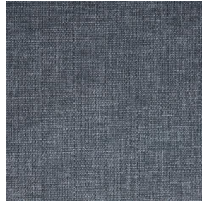
MUNA Acier 18