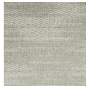
MUNA Coco 142