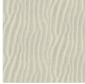
SABLE Lin 11 Print pattern