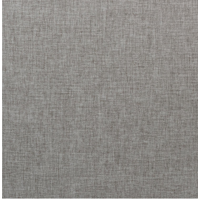
NORA Gris envers blanc 63 Printing support