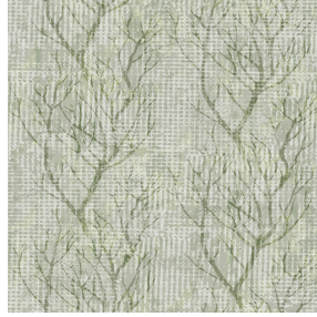
6058 Kaki 148 Print pattern