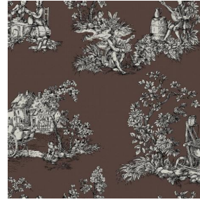
ZELIE Taupe 95