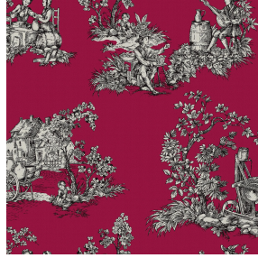
ZELIE Rubis 59 Print pattern