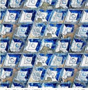
CLEMENTINA Azur 137