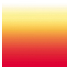
ZADIG Agrume 69 Print pattern