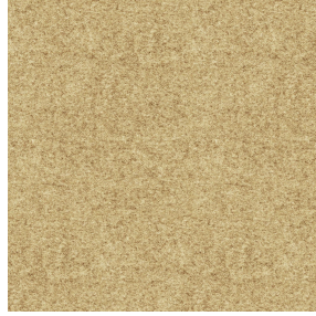
ELAINA Beige 63 Print pattern