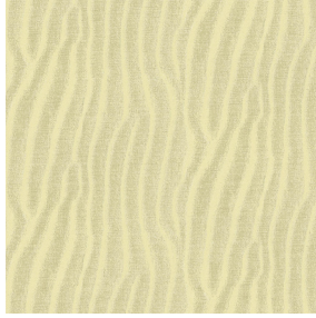
SABLE Sable 67 Print pattern