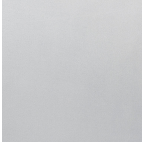
NOCTWIN BPI 00 Printing support