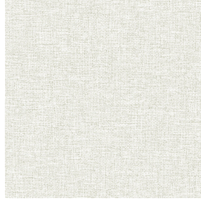
MUNA lin 11 Print pattern