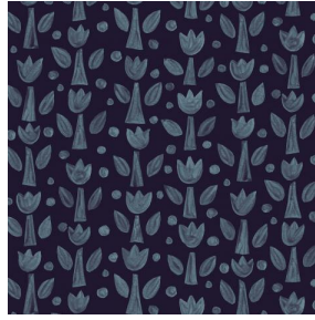
TULIPE Nuit 128