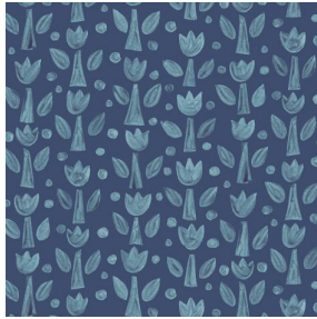
TULIPE Indigo 119