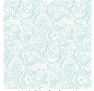
ONDES glacier 43