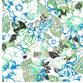
CHARMETTE Turquoise 53 Print pattern