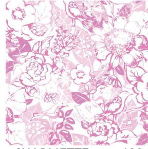
CHARMETTE rose 129