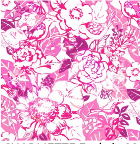
CHARMETTE Fuchsia 33