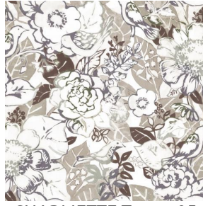
CHARMETTE Taupe 95