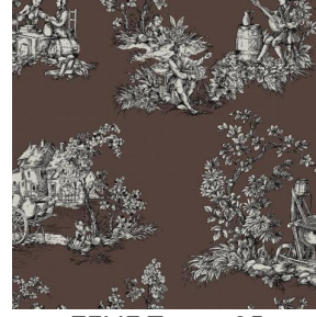
ZELIE Taupe 95