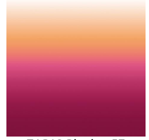
ZADIG Pivoine 57