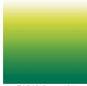
ZADIG Cactus 36