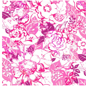
CHARMETTE Fuchsia 33 Print pattern