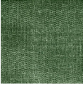
MUNA Lierre 124