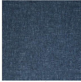
MUNA Indigo 144