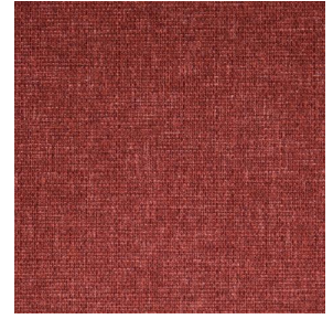
MUNA Rouge 21