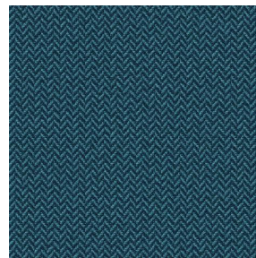
SCOURTIN Céladon 135