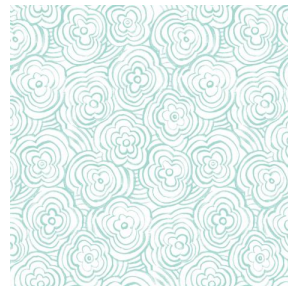
ONDES glacier 43