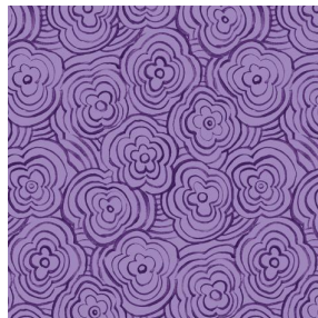
ONDES Violine 105