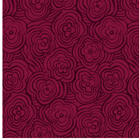
ONDES Opéra 104 Print pattern